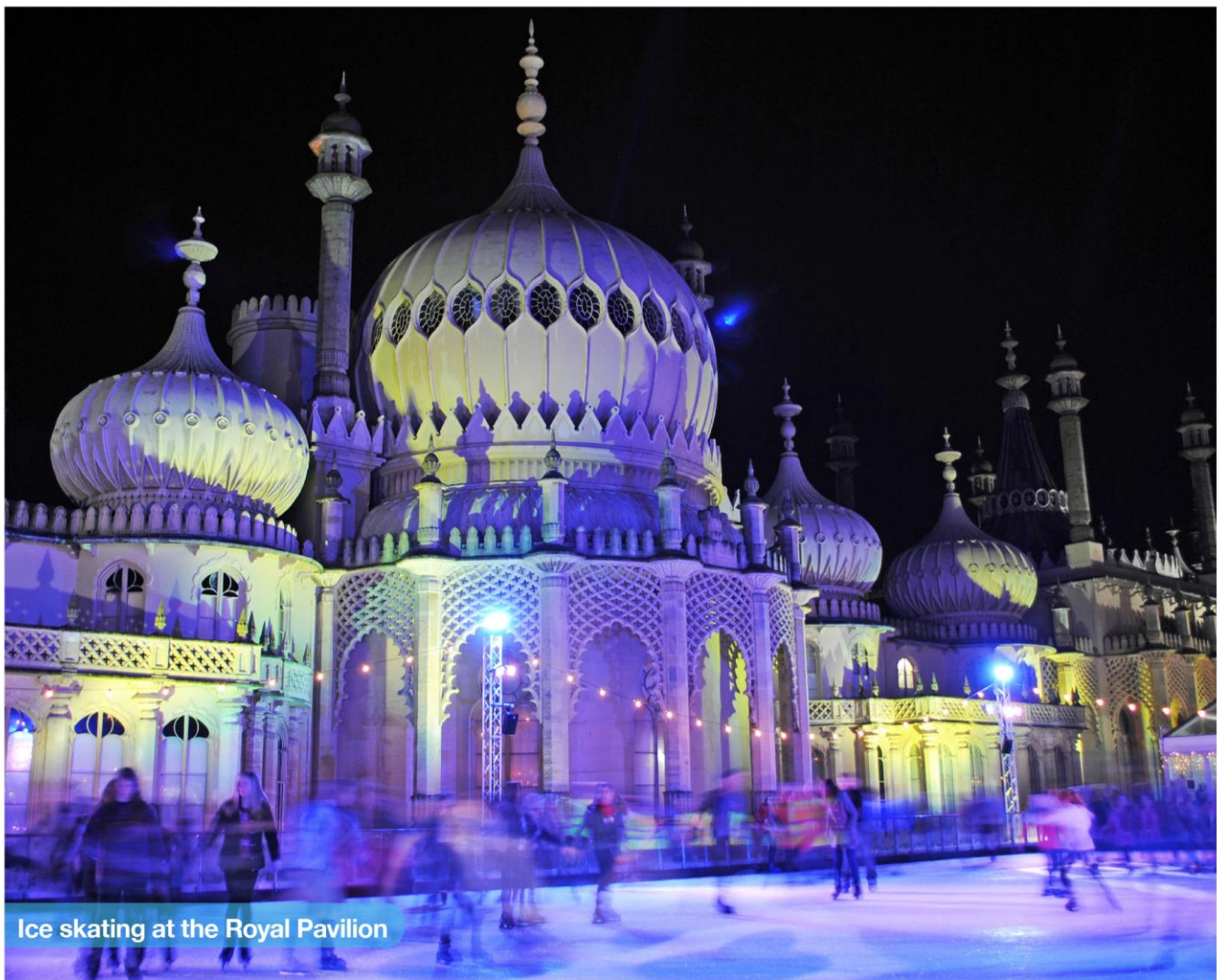
Ice skating at the Royal Pavilion