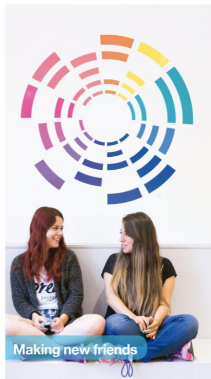
Making new friends